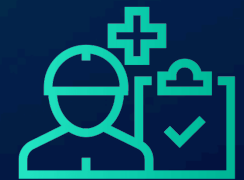
HEALTH AND SAFETY COMPLIANCE