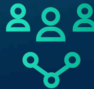
REMOTE MONITORING (IOT)