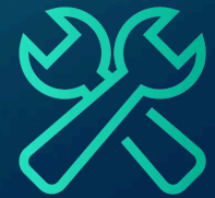
REACTIVE MAINTENANCE AND PPM